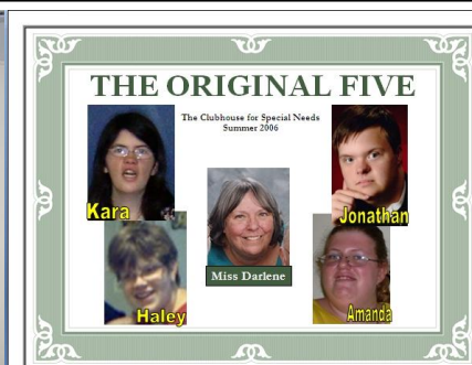
The original five were recognized.