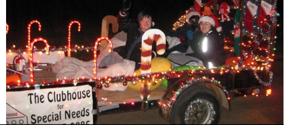
Eules Parade of Lights float

One day admission to any Disney Theme Park!