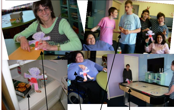
Stanley arrives Stanley poses with the group.