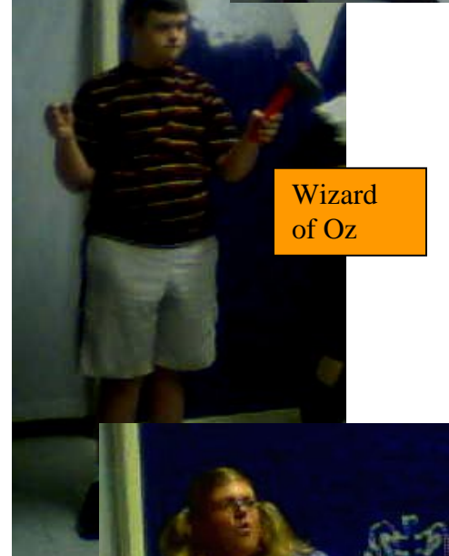
Wizard of Oz